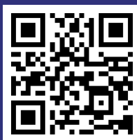
K-CIS (CENTRALIZED INSPECTION SYSTEM)